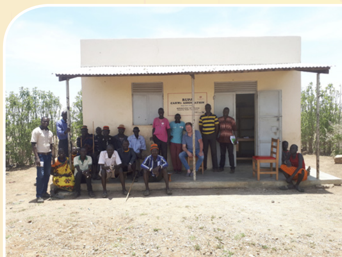
The CAHWs of the RUPA CAHW association gathered outside their veterinary outlet.

groups are profitable. Motorbikes have been provided to two of the groups enabling them to service a bigger area. In addition, they are used as a taxi service in the community which provides another income source for the groups. Three groups have also been provided with solar-powered fridges to store vaccines. One of the biggest challenges in the groups is the level of illiteracy which can cause problems in the work of the CAHWs (calculating dosages of medicines) and in the viability of the vet outlets (lack of business skills e.g. stock control, records etc)