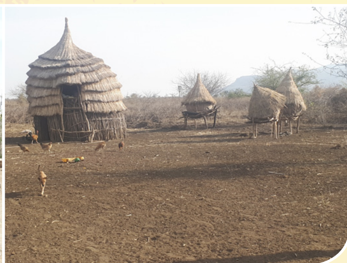
Typical dwelling of a Karamoja pastoralist family