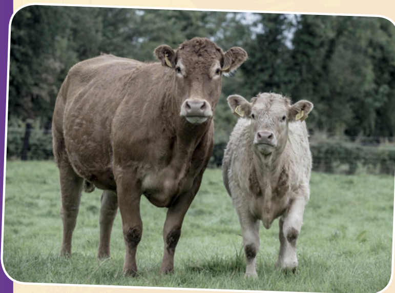
Altamira Kate and her calf