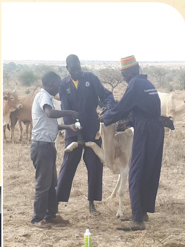
Cattle being wormed at a gathering organized by local veterinary authorities, VSF Belgium and other livestock Non-Governmental Organisations (NGOs)

The other element of the programme is vaccination of livestock for local endemic diseases. Up to 10,000 goats have been vaccinated against Contagious Caprine Pleuropneumonia (CCPP) and 5000 against Pestes de Petits Ruminants (PPR). Along with other non-governmental organisations (NGOs) over 25,000 cattle have been vaccinated against Contagious Bovine Pleuropneumonia (CBPP) with the government providing the vaccines and the NGOs organising the gatherings and the recruitment of CAHWs to carry out the vaccination.