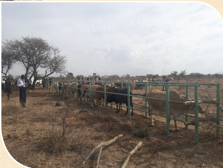
Cattle being put through a crush to be vaccinated and treated with insecticides